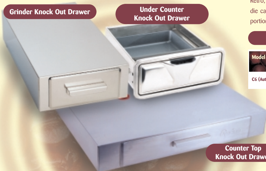
Counter Top Knock Out Drawer